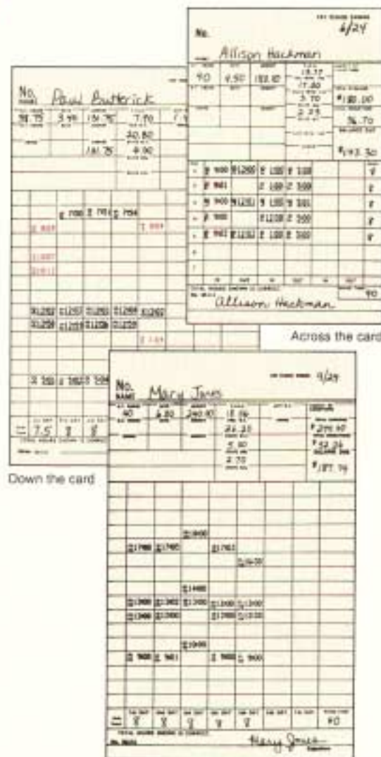
Down the card